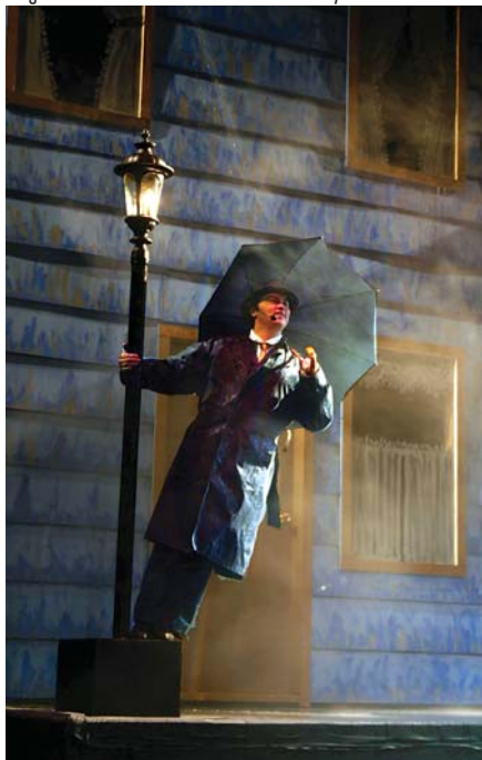
Singin' and dancin' in the rain.

When I was first approached by the Fairbanks Light Opera Theatre, a local community theatre organization, about designing lighting and some of the effects for Singin' in the Rain I thought the mandatory rain effect was a relatively straight forward technical problem—a water pump and some garden hose attached to a batten should do the trick. Later in the design process, however, I learned that while making it rain was easy, making it stop on command and figuring out a way to clean it up quickly so the show could proceed required some technical ingenuity. I considered a couple of options: Grates in the floor would allow the rain water to flow into the trap room below the stage where it could be captured and pumped back up. This solution had the obvious drawback of forcing the dancers to work around the grated portions of the stage—or risk ruining their shoes. I also considered moving the rain effect downstage in front of the proscenium so the audience would view the rain scene through the falling water. This would avoid the grate problem, and the stage area would stay dry, but risked soaking the orchestra in the pit. I needed something that allowed the rain effect to happen up stage and also provided a way to capture the water without disturbing the stage