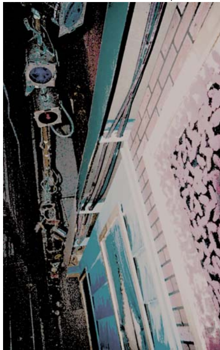
Two runs of sprinkler hose supported by plywood hose holders are hidden from view behind the baffle.

floor. The solution I eventually devised was a “rain wagon,” a unit that would contain everything needed for the rain effect and could be moved into place anywhere on stage.